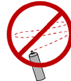
Bad - uneven paint coverage