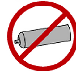
Bad - uneven paint flow