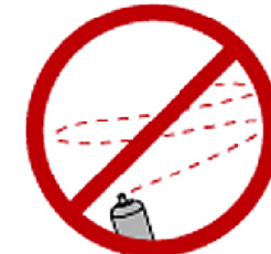
Bad - uneven paint coverage