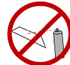
Bad - paint will get under the stencil