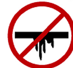
Bad - drip drip drip